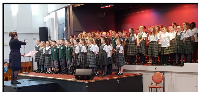
Senior Choir - Honourable Mention