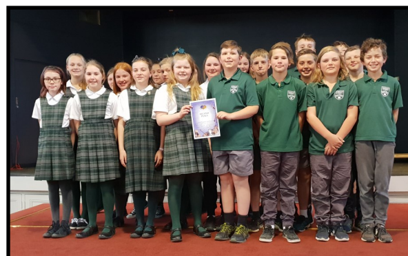
6M Verse Speaking - Second Place