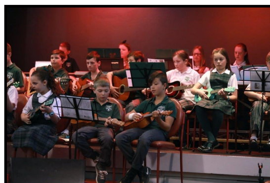
Orchestra - Honourable Mention