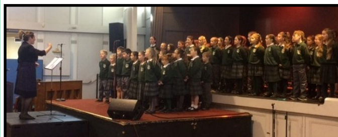
Junior Choir - Second Place

Morgan Street students did us proud at the Eisteddfod Last week.