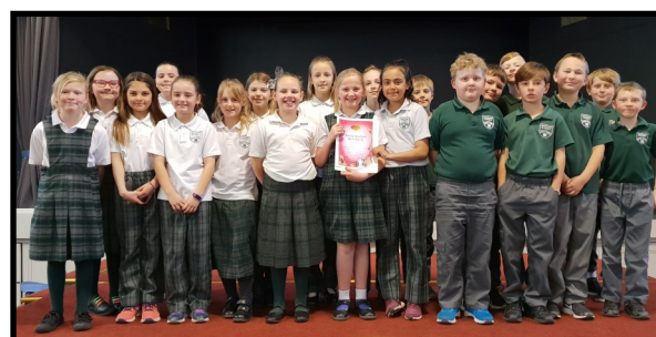
4F Verse Speaking - Honourable Mention