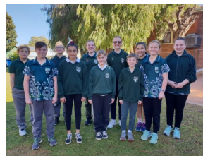
Finalists from Years 5 & 6