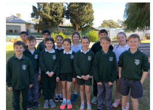
Finalists from Years 3 & 4