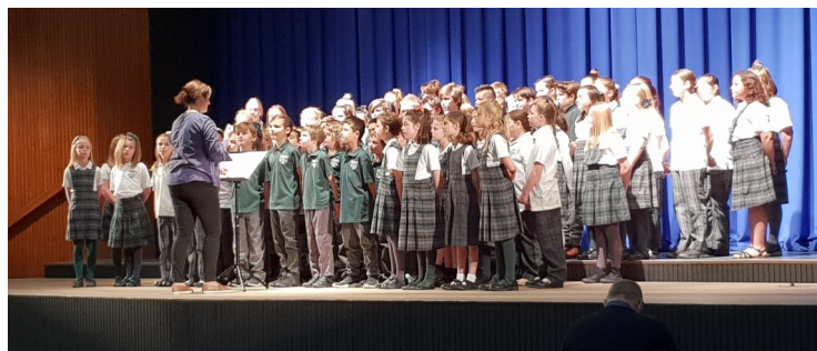
Senior Choir performing at the Eisteddfod this morning