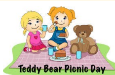
Teddy Bear Picnic Day

You're invited to attend Broken Hill High School's annual Teddy Bear's Picnic for children 5 years and under.